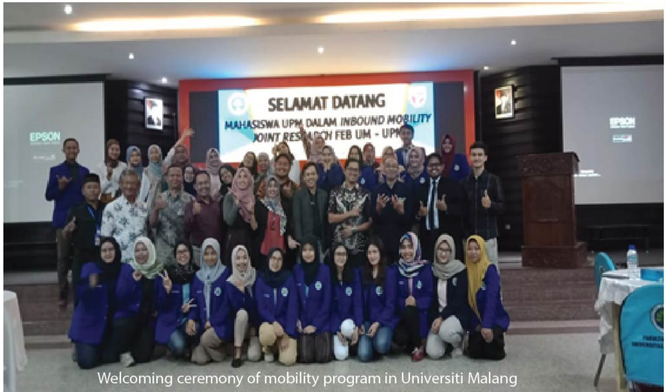
Welcoming ceremony of mobility program in Universiti Malang