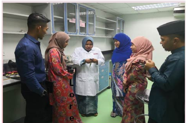
The postgraduate students visited the lab at the Laboratory Halal Service, HPRI