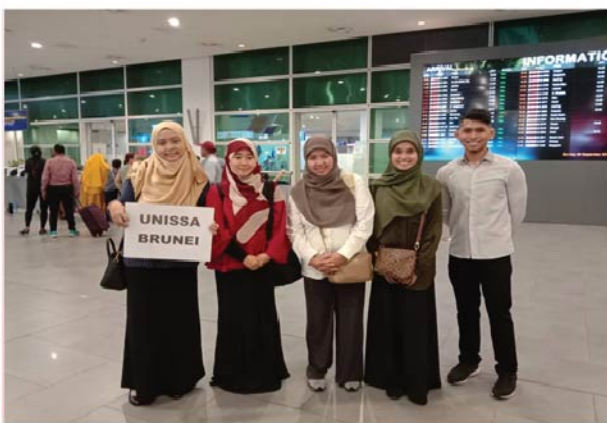
UNISSA mobility graduate students arrived at KLIA 2 on September 29, 2019