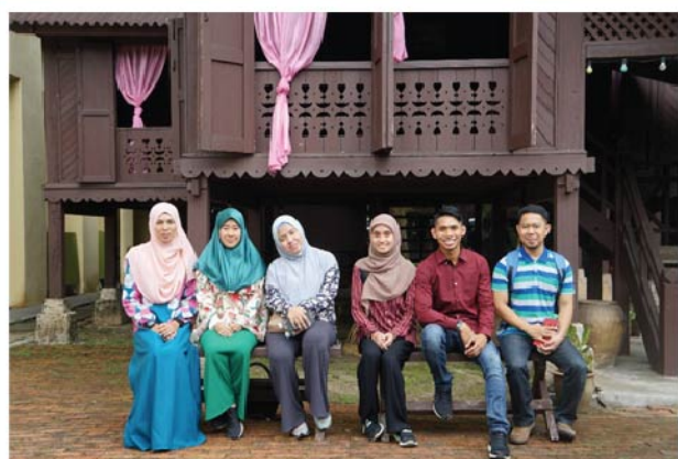
Visiting Muzium Warisan Melayu, UPM