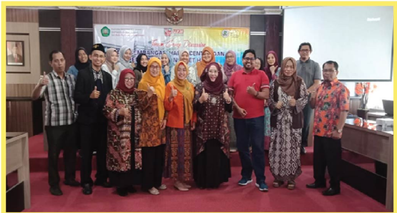
Visiting Universiti Islam Malang (UNISMA), Indonesia