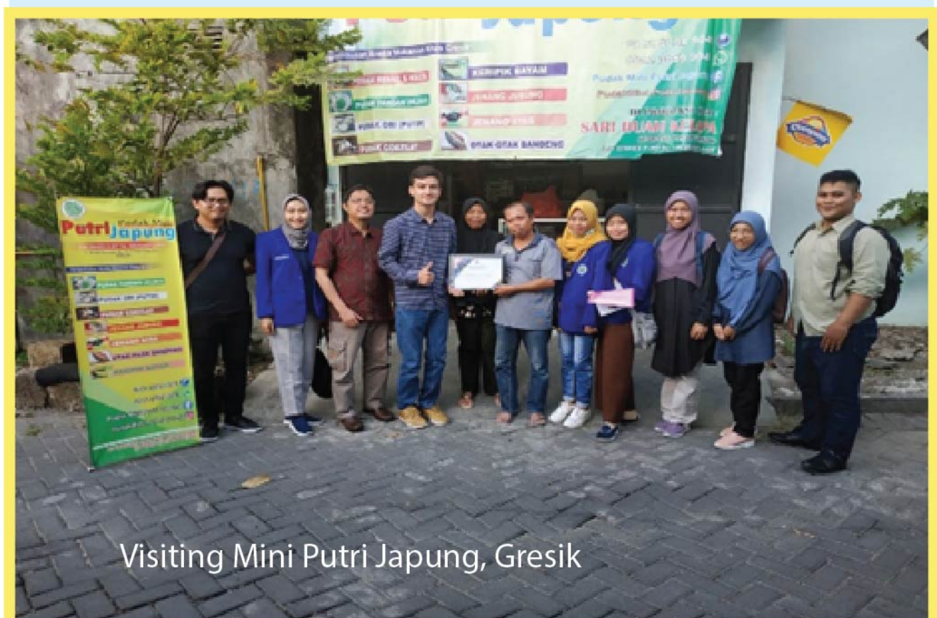
Visiting Mini Putri Japung, Gresik