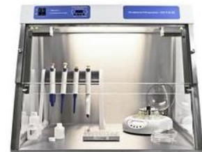
qPCR assay preparation